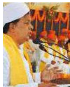
97 th Convocation – 2015 Padma Vibhushan Dr. G Madhavan Nair