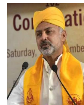
102 nd Convocation – 2022 Chairman & CEO Palo Alto Net. Shri Nikesh Arora