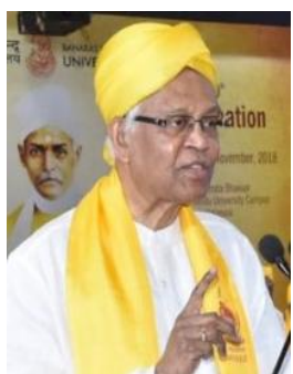
100 th Convocation – 2018 Padma Vibhushan Dr. Raghunath A Mashelkar, FRS