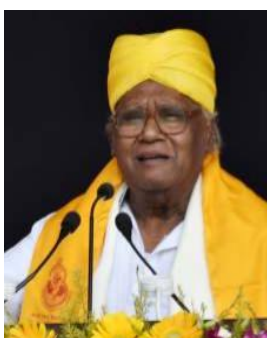
99 th Convocation – 2017 Bharat Ratna Prof. C N R Rao, FRS